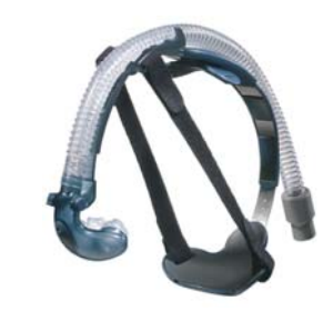
Breeze SleepGear With DreamSeal Assembly

Breeze SleepGear With Nasal Pillows Assembly